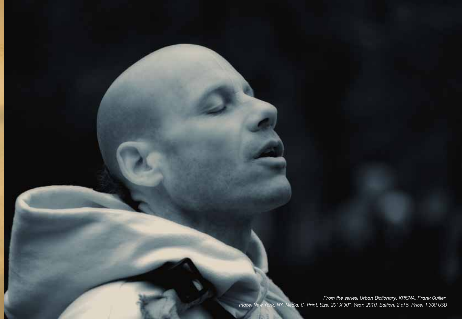
From the series: Urban Dictionary, KRISNA, Frank Guiller, Place: New York, NY, Media: C- Print, Size: 20" X 30", Year: 2010, Edition: 2 of 5, Price: 1,300 USD