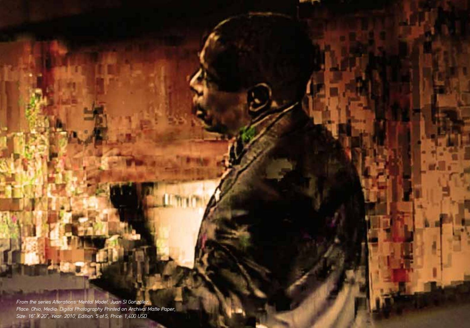
From the series Alterations: Mental Model, Juan SI González, Place: Ohio, Media: Digital Photography Printed on Archival Matte Paper, Size: 16" X 20", Year: 2010, Edition: 5 of 5, Price: 1,400 USD