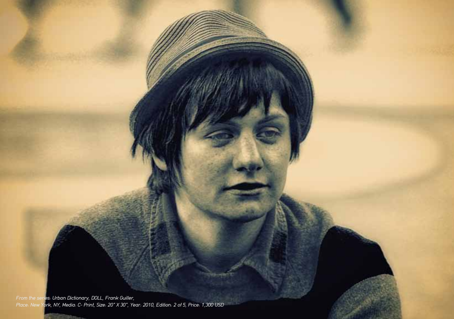
From the series: Urban Dictionary, DOLL, Frank Guiller, Place: New York, NY, Media: C- Print, Size: 20" X 30", Year: 2010, Edition: 2 of 5, Price: 1,300 USD