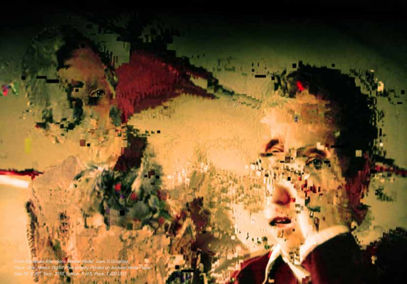
From the series Alterations: Mental Model, Juan SI González, Place: Ohio, Media: Digital Photography Printed on Archival Matte Paper, Size: 16" X 20", Year: 2010, Edition: 5 of 5, Price: 1,400 USD