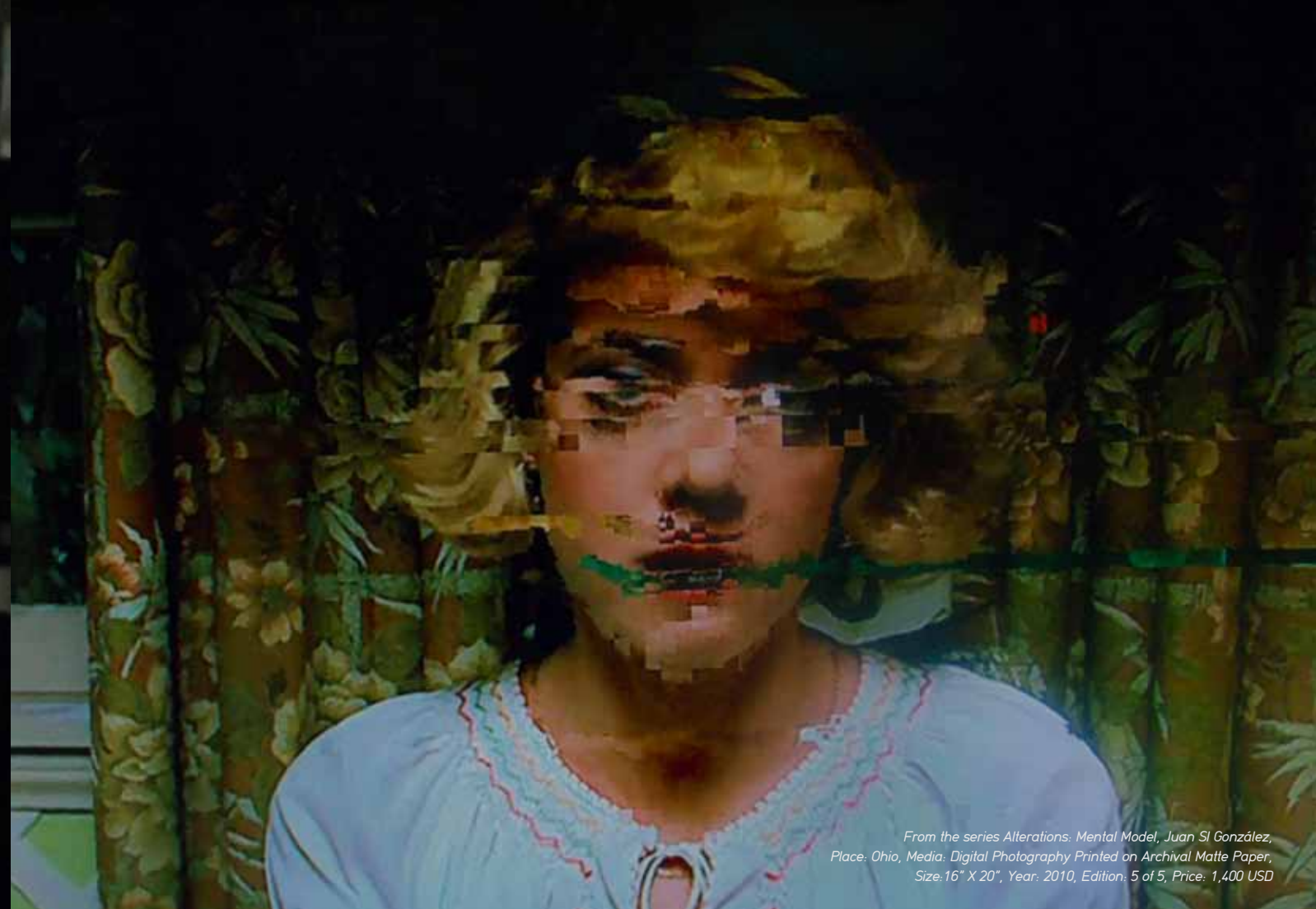
From the series Alterations: Mental Model, Juan SI González, Place: Ohio, Media: Digital Photography Printed on Archival Matte Paper, Size: 16" X 20", Year: 2010, Edition: 5 of 5, Price: 1,400 USD