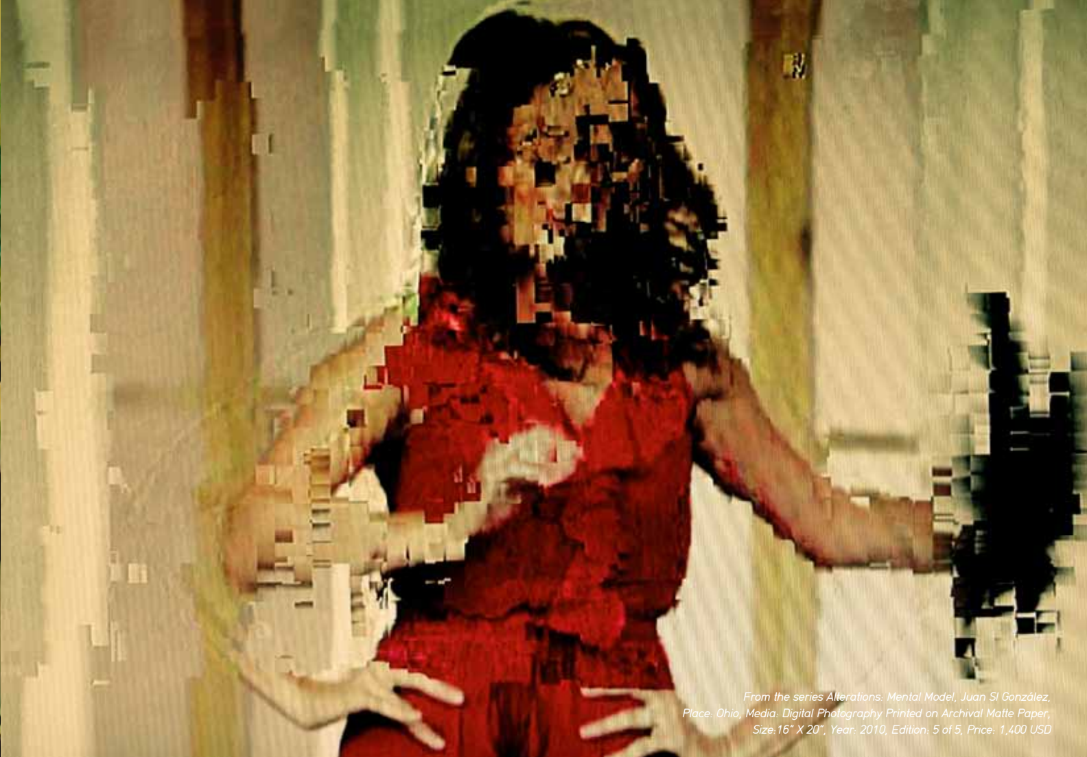
From the series Alterations: Mental Model, Juan SI González, Place: Ohio, Media: Digital Photography Printed on Archival Matte Paper, Size: 16" X 20", Year: 2010, Edition: 5 of 5, Price: 1,400 USD