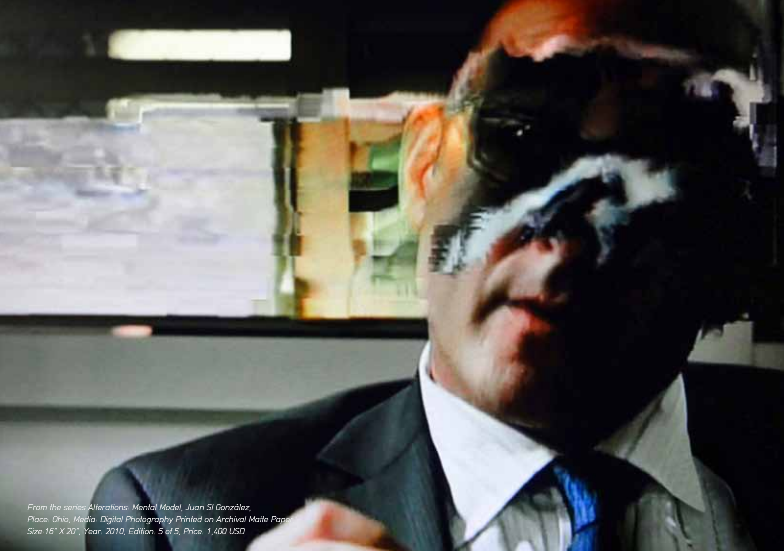
From the series Alterations: Mental Model, Juan SI González, Place: Ohio, Media: Digital Photography Printed on Archival Matte Paper, Size: 16" X 20", Year: 2010, Edition: 5 of 5, Price: 1,400 USD