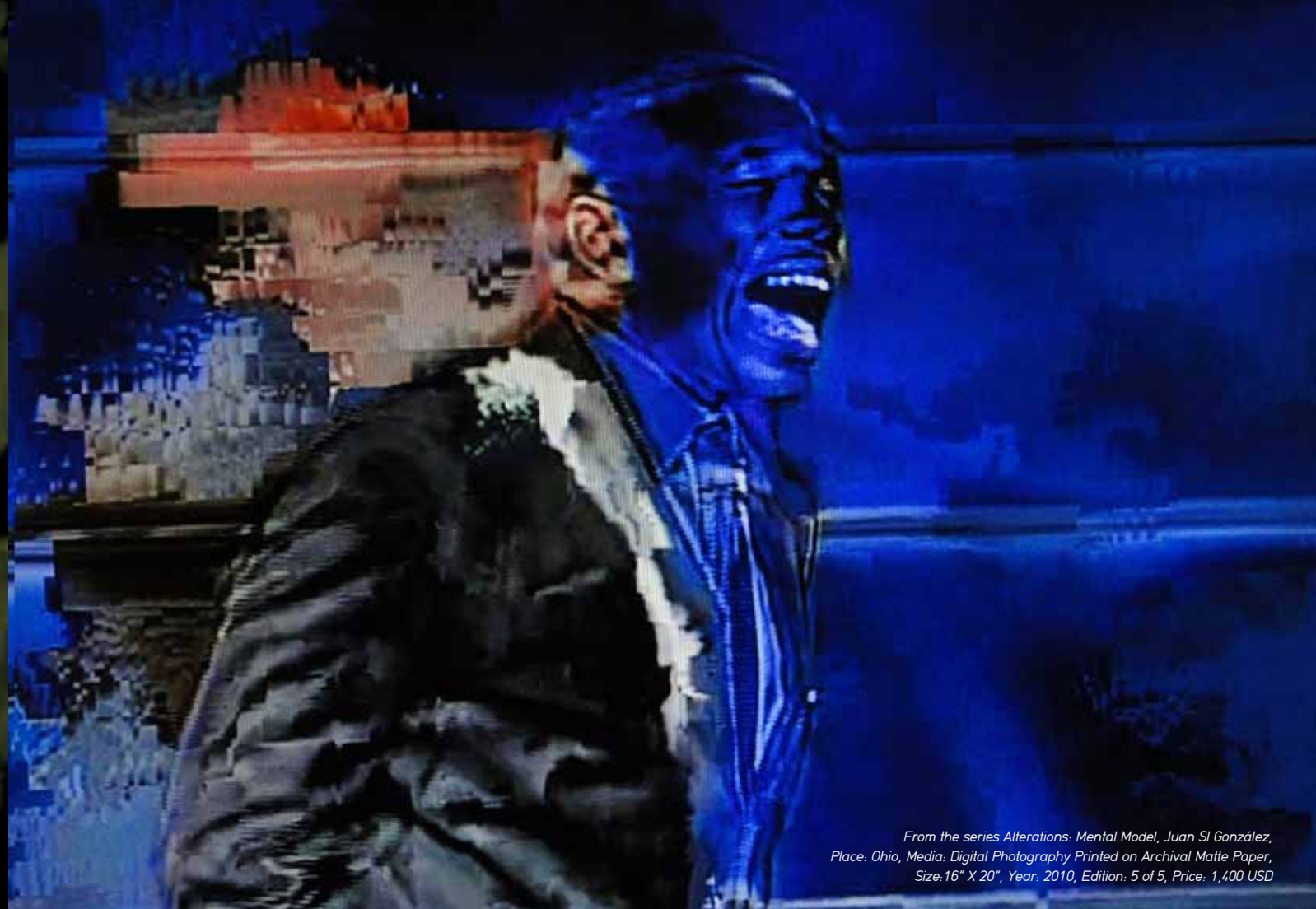
From the series Alterations: Mental Model, Juan SI González, Place: Ohio, Media: Digital Photography Printed on Archival Matte Paper, Size: 16" X 20", Year: 2010, Edition: 5 of 5, Price: 1,400 USD