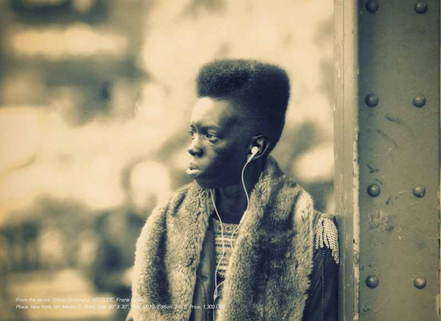
From the series: Urban Dictionary, APTITUDE, Frank Guiller, Place: New York, NY, Media: C- Print, Size: 20" X 30", Year: 2010, Edition: 2 of 5, Price: 1,300 USD