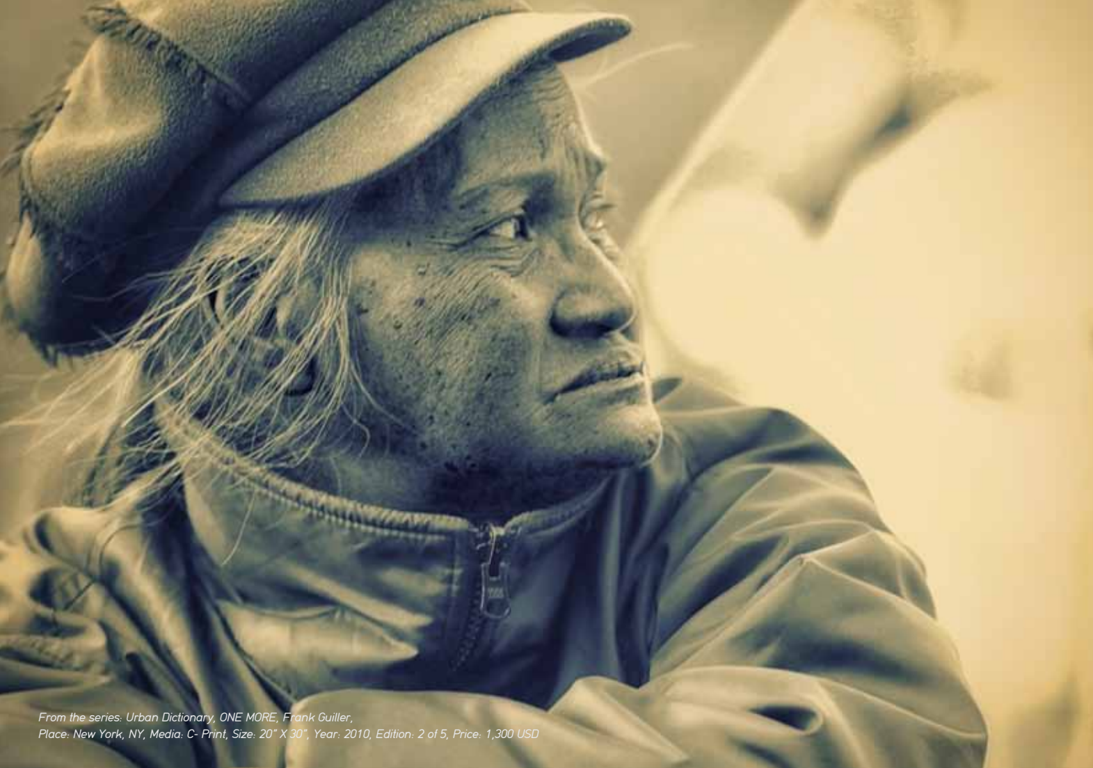
From the series: Urban Dictionary, ONE MORE, Frank Guiller, Place: New York, NY, Media: C- Print, Size: 20" X 30", Year: 2010, Edition: 2 of 5, Price: 1,300 USD