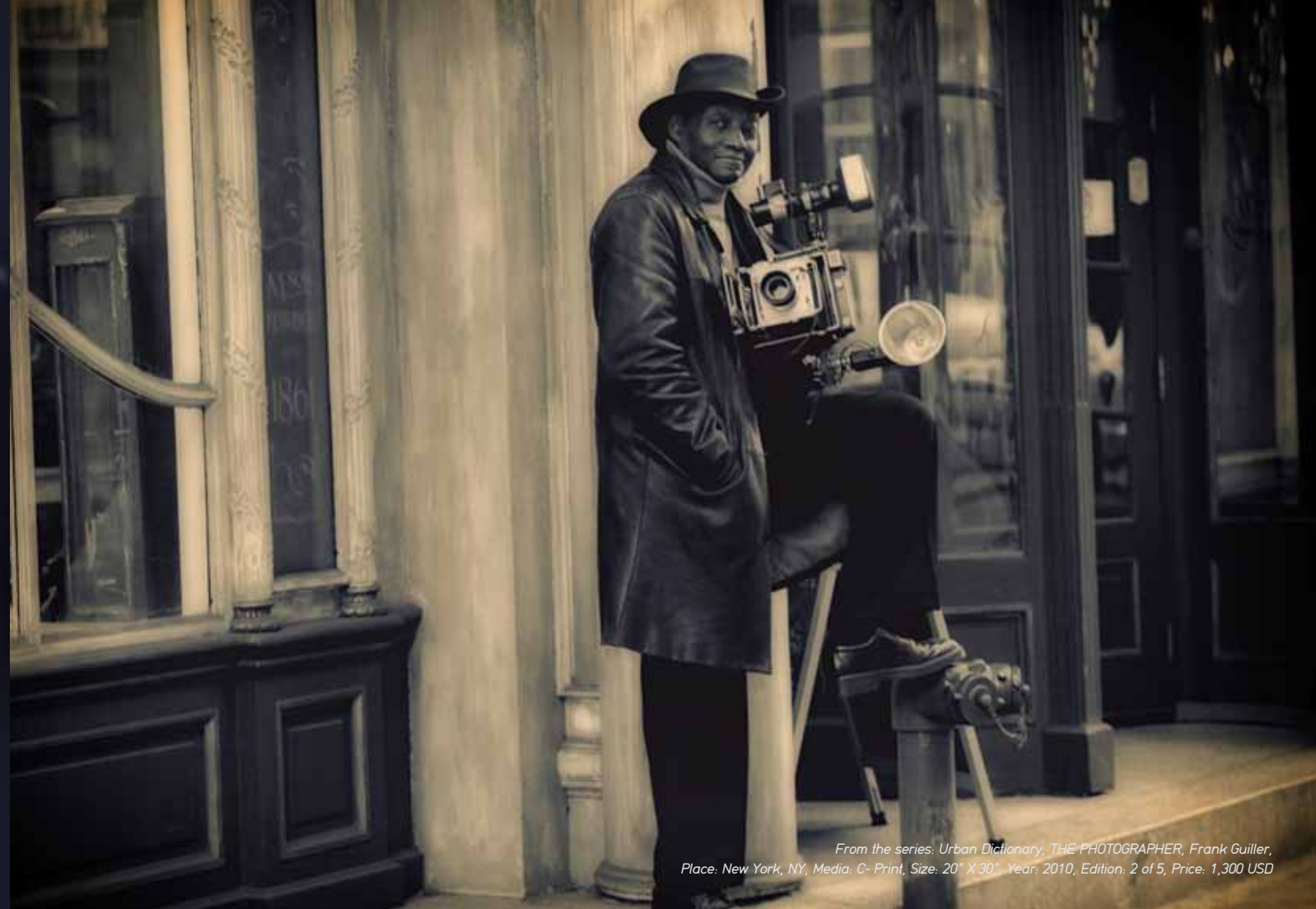
From the series: Urban Dictionary, THE PHOTOGRAPHER, Frank Guiller, Place: New York, NY, Media: C- Print, Size: 20" X 30", Year: 2010, Edition: 2 of 5, Price: 1,300 USD