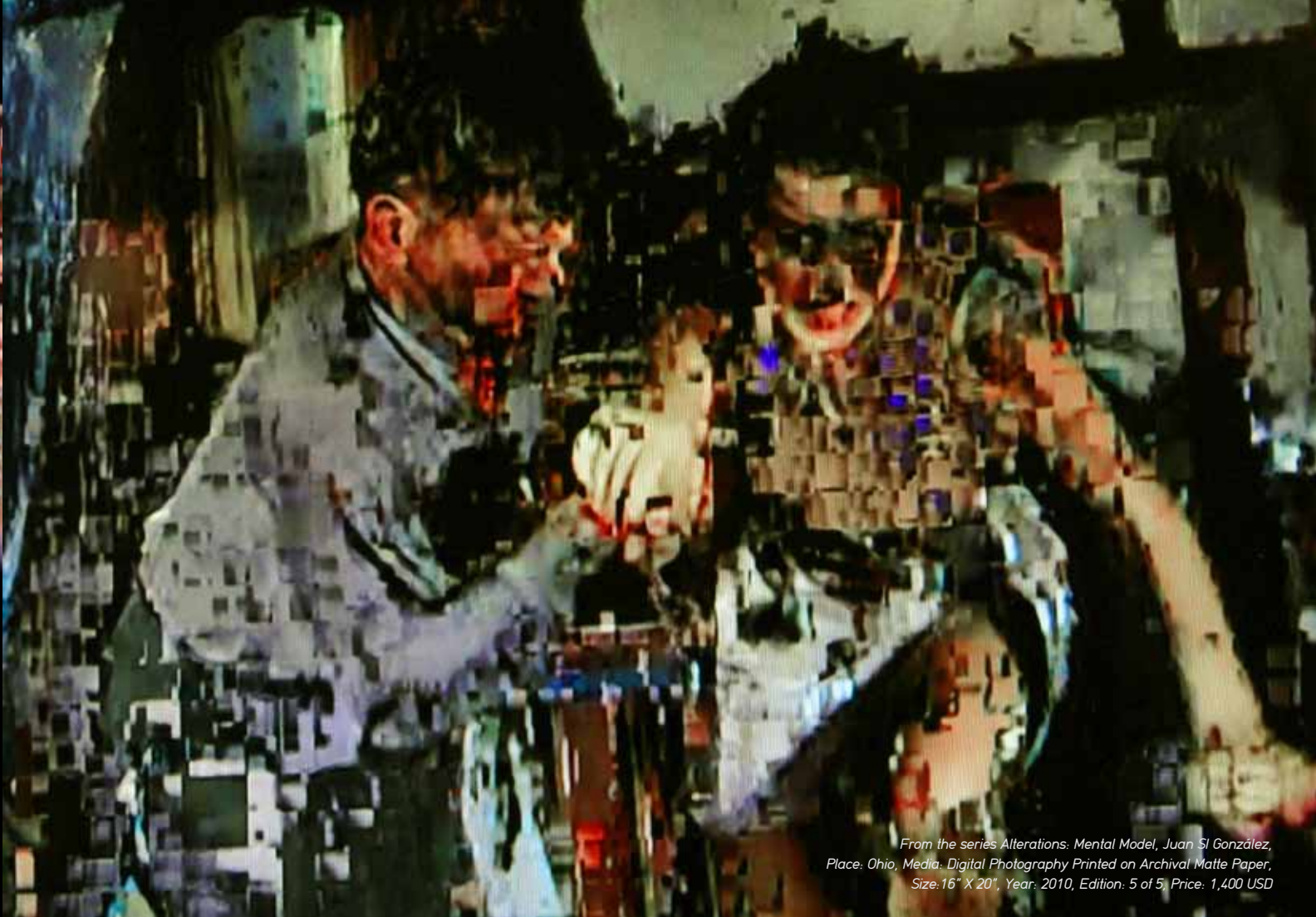
From the series Alterations: Mental Model, Juan SI González, Place: Ohio, Media: Digital Photography Printed on Archival Matte Paper, Size: 16" X 20", Year: 2010, Edition: 5 of 5, Price: 1,400 USD