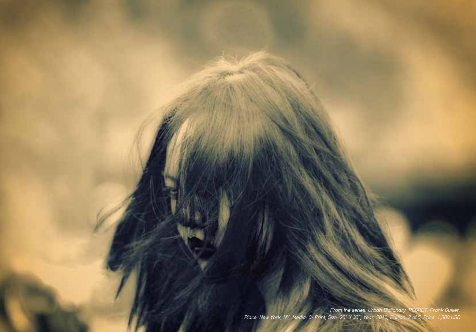
From the series: Urban Dictionary, REGRET, Frank Guiller, Place: New York, NY, Media: C- Print, Size: 20" X 30", Year: 2010, Edition: 2 of 5, Price: 1,300 USD