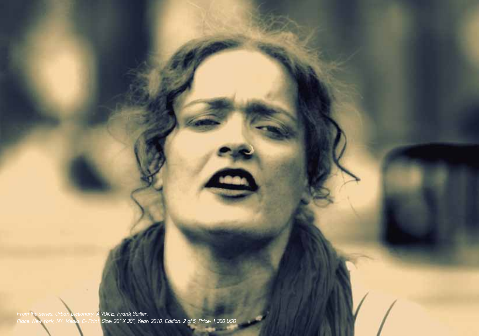
From the series: Urban Dictionary, A VOICE, Frank Guiller, Place: New York, NY, Media: C- Print, Size: 20" X 30", Year: 2010, Edition: 2 of 5, Price: 1,300 USD