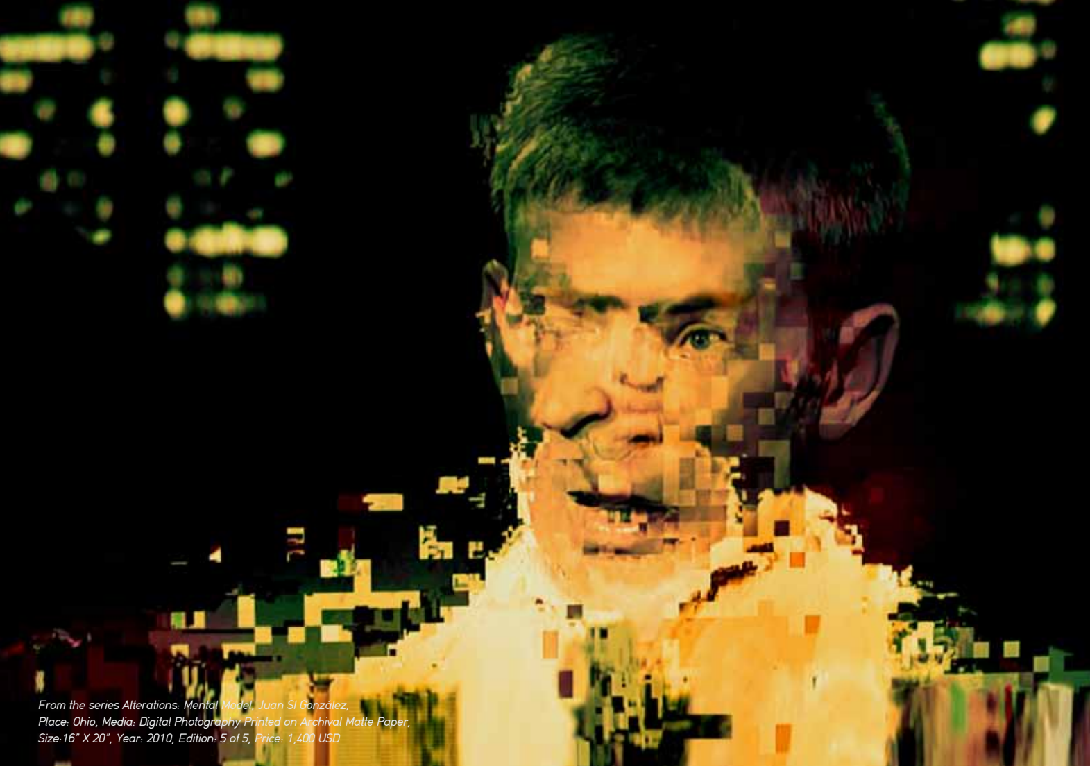
From the series Alterations: Mental Model, Juan SI González, Place: Ohio, Media: Digital Photography Printed on Archival Matte Paper, Size: 16" X 20", Year: 2010, Edition: 5 of 5, Price: 1,400 USD