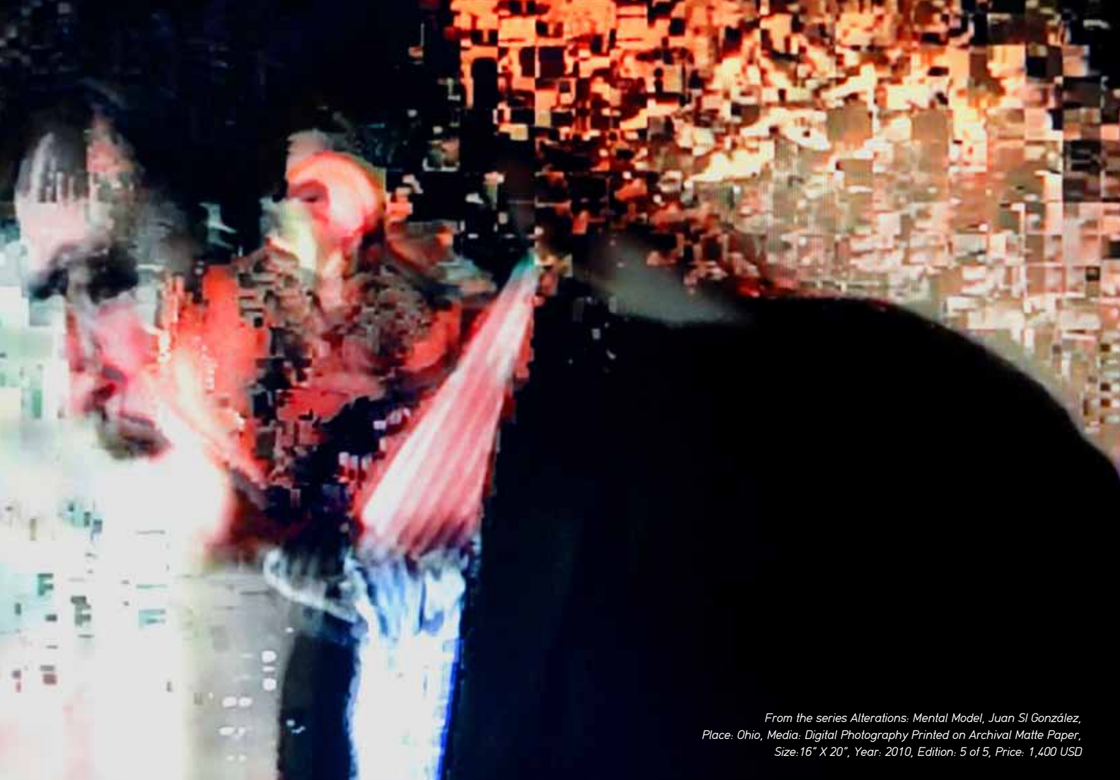
From the series Alterations: Mental Model, Juan SI González, Place: Ohio, Media: Digital Photography Printed on Archival Matte Paper, Size: 16" X 20", Year: 2010, Edition: 5 of 5, Price: 1,400 USD