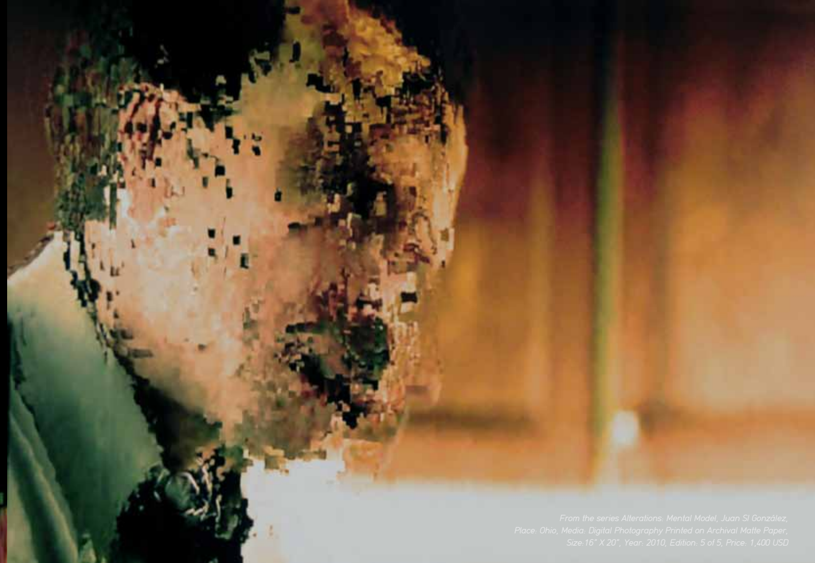
From the series Alterations: Mental Model, Juan SI González, Place: Ohio, Media: Digital Photography Printed on Archival Matte Paper, Size: 16" X 20", Year: 2010, Edition: 5 of 5, Price: 1,400 USD