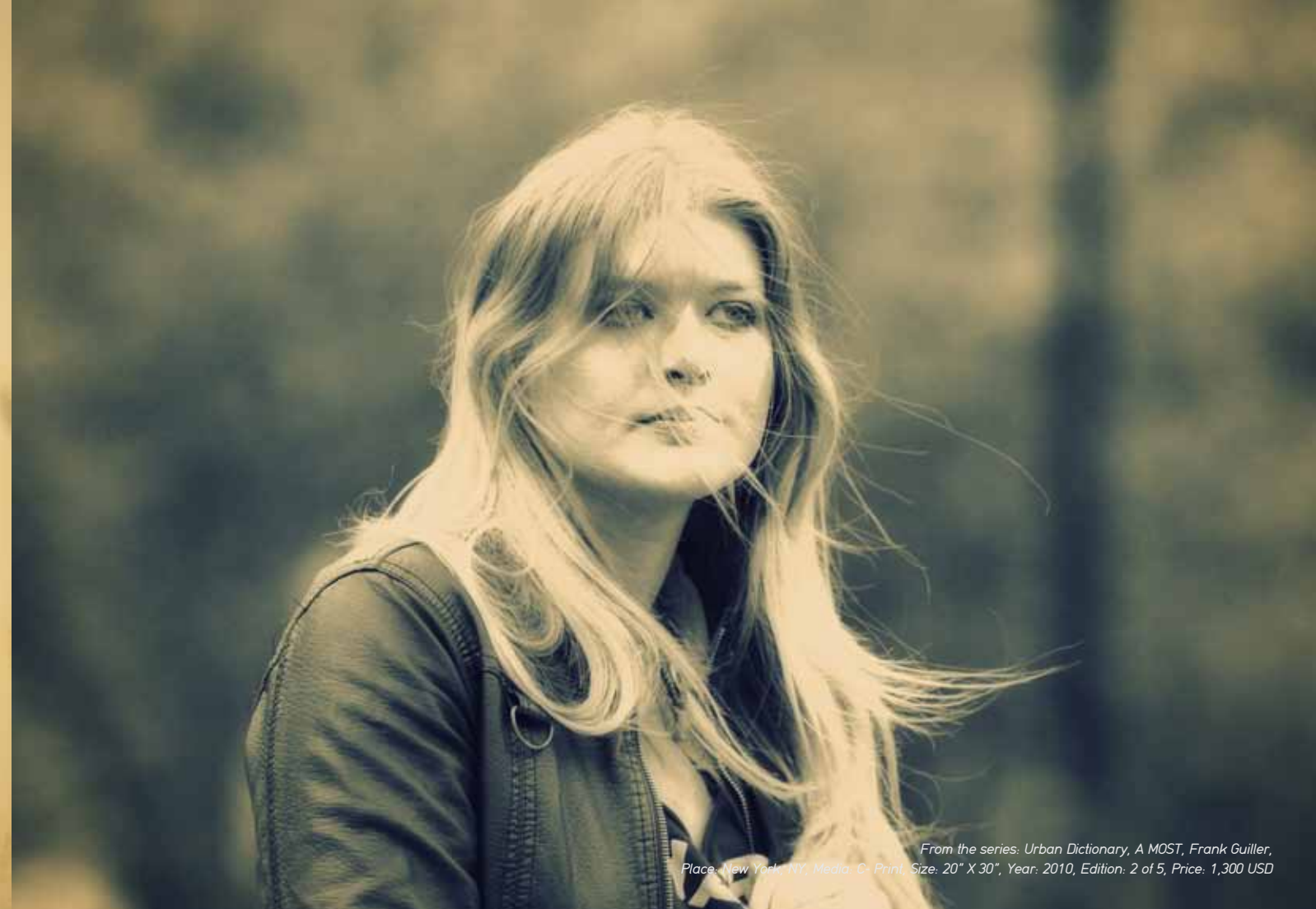
From the series: Urban Dictionary, A MOST, Frank Guiller, Place: New York, NY, Media: C- Print, Size: 20" X 30", Year: 2010, Edition: 2 of 5, Price: 1,300 USD