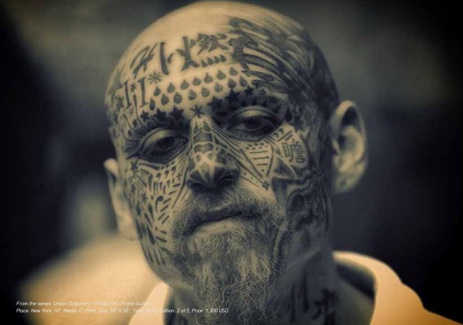
From the series: Urban Dictionary, UNIVALENT, Frank Guiller, Place: New York, NY, Media: C- Print, Size: 20" X 30", Year: 2010, Edition: 2 of 5, Price: 1,300 USD