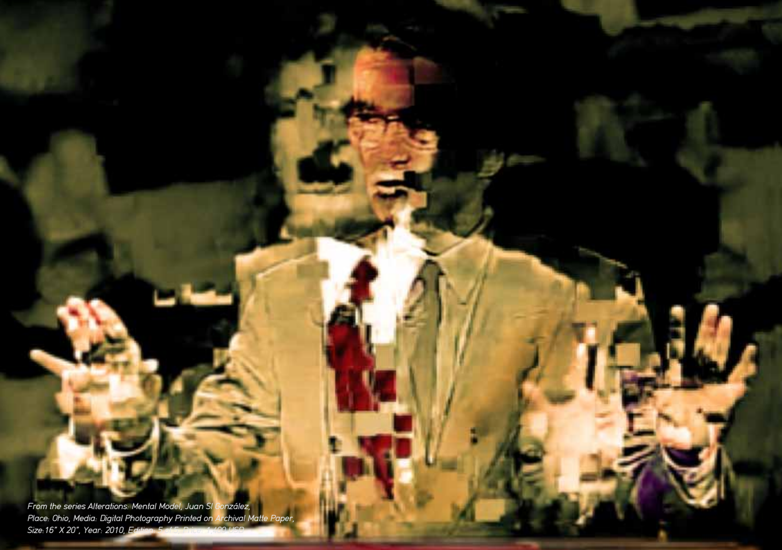
From the series Alterations: Mental Model, Juan SI González, Place: Ohio, Media: Digital Photography Printed on Archival Matte Paper, Size: 16" X 20", Year: 2010, Edition: 5 of 5, Price: 1,400 USD