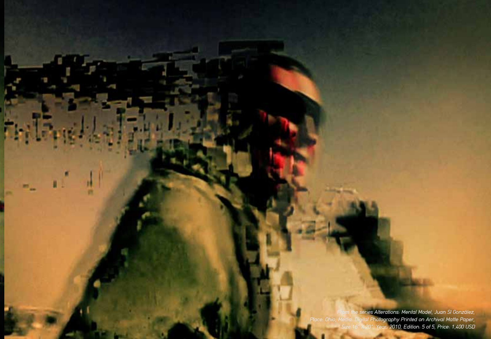
From the series Alterations: Mental Model, Juan SI González, Place: Ohio, Media: Digital Photography Printed on Archival Matte Paper, Size: 16" X 20", Year: 2010, Edition: 5 of 5, Price: 1,400 USD